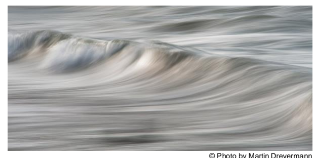
© 1 note by Wartin Dreverman